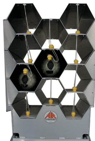
AIR-KADDY™ with Thread Savers® AK24-11TS