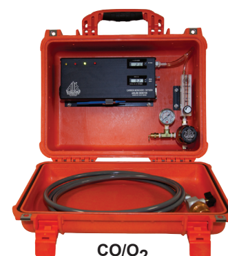
CO/O 2 Cylinder Test Kit AQTCOO2KIT